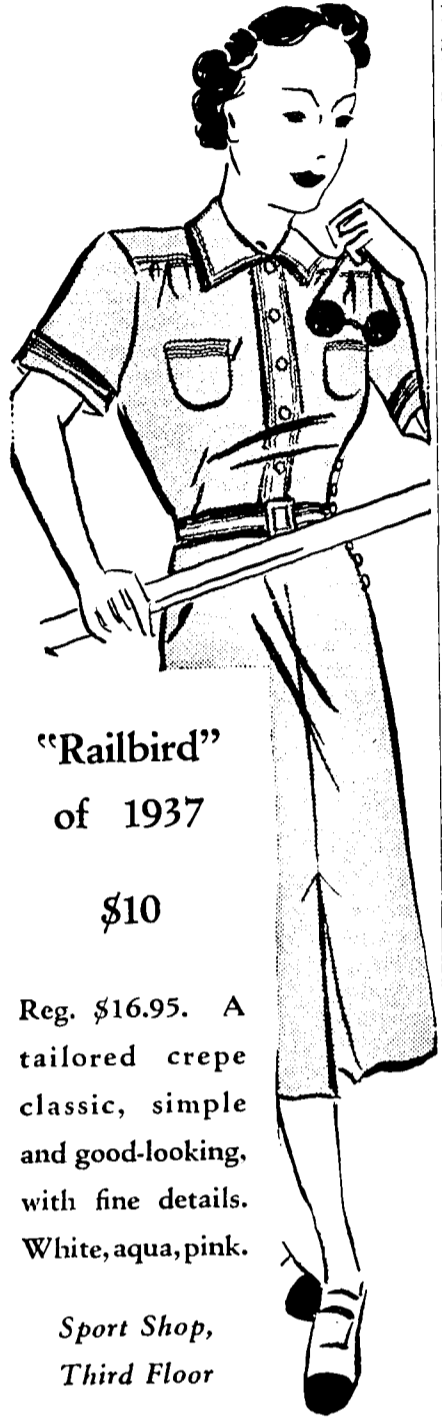
"Railbird" of 1937

Summer Store Hours 9.30-5.00 LEWEE'S 1122-24 CHESTNUT ST PHILADELPHIA